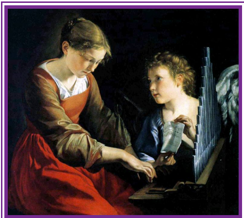
Orazio Gentileschi (1563–1639)

COST — Total cost to be a member of the 2018 National Catholic Band Association Commissioning Consortium is $50. ($50 to be paid by the member school with $50 to be matched by NCBA.) Cost to non-members is $100. Each participating school will receive a full score and all parts. Packaging and mailing costs are included.