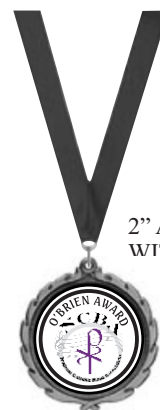
2" AWARD MEDAL WITH NECK RIBBON